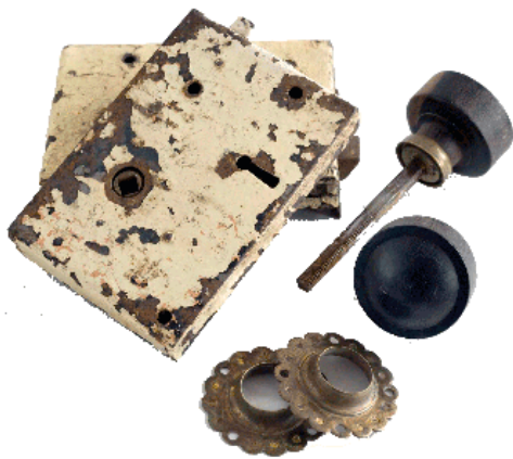
A hundred year old lock set with wood turned handles.

Our homes are special places, they are made up of many textures, shapes and colours. A little history, something from the past always adds a nice touch to any home.